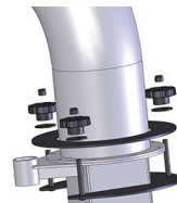
360 Rotational Kit