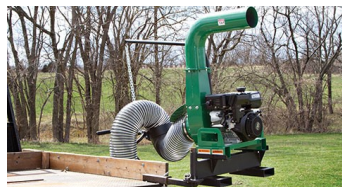
Stake Body Swing Away Hitch