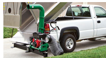
Swing Away Hitch