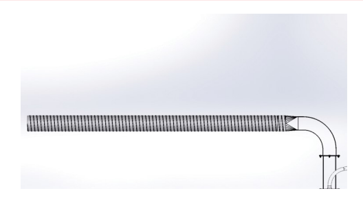
Discharge Hose Kits