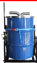
Additional 205L Drum Tipper