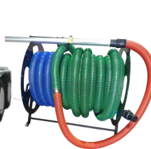
Whip End Flex Hose