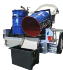
Drum Waste Discharge Chute (Trailer only)